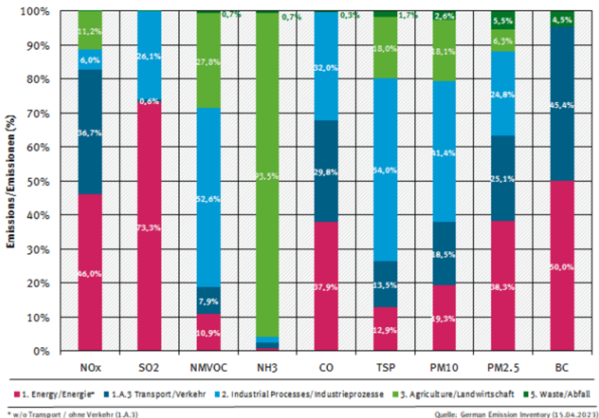
2021 percentages per air pollutant / Anteile pro Luftschadstoff

Contribution of NFR categories to the emissions