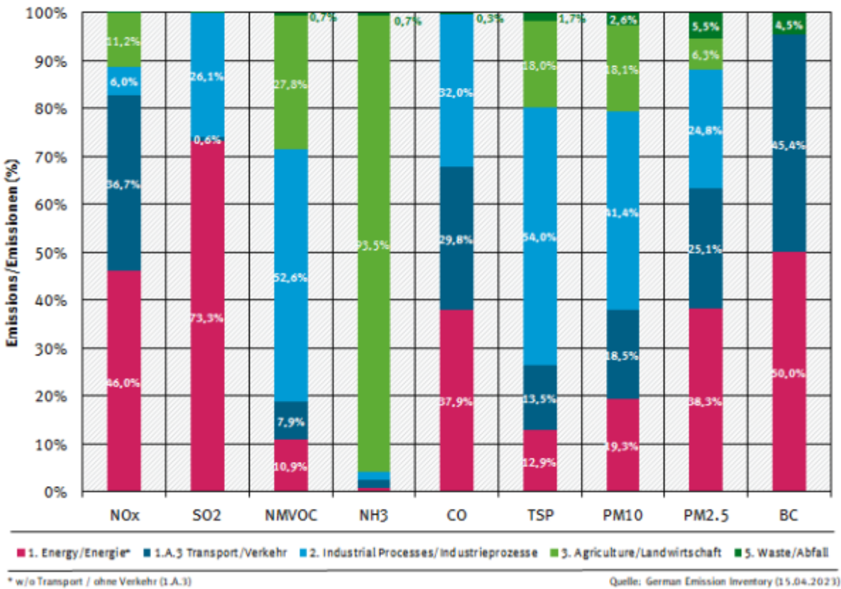
2021 percentages per air pollutant / Anteile pro Luftschadstoff

Contribution of NFR categories to the emissions