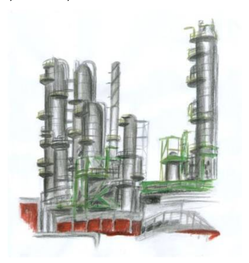
Table 9: Emission factors applied for emissions from oil refinement and storage

The emission factors used for NMVOC, CO, NO<sub>x</sub> und SO<sub>2</sub> were determined by evaluating emission declarations from refineries for the period 2004 through 2016, in the framework of a research project (Bender & von Müller, 2019)<sup>11)</sup>. Since no data was available for earlier years, the data obtained this way was used for all years as of 1990.